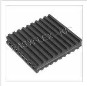
Metal Sandwich Pad