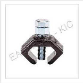
Rod Bracing Clamps