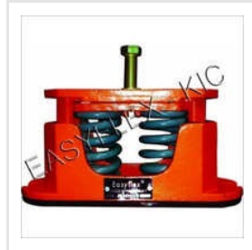
Cased Spring Mount