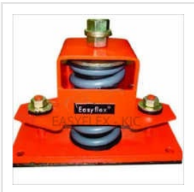
Restrained Spring Mount