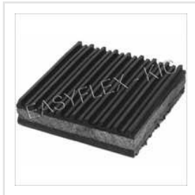
Cork Sandwich Pad