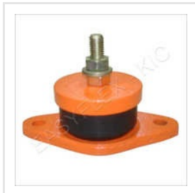
Fail Safe Mounts