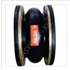
Single Arch Expansion Joint