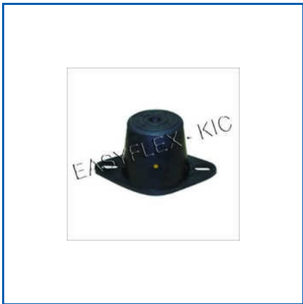
TURRET RUBBER MOUNTINGS