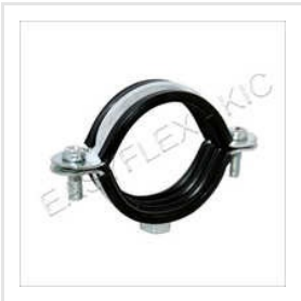
Rubber Lined Clamps