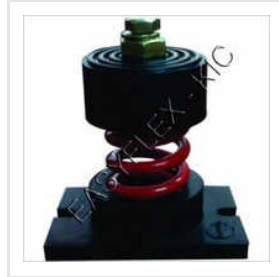
Cup Spring Mount