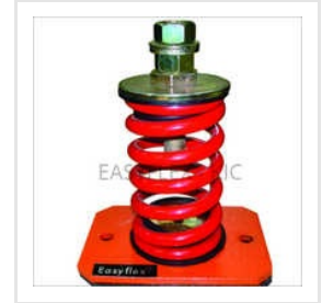
Open Spring Mount